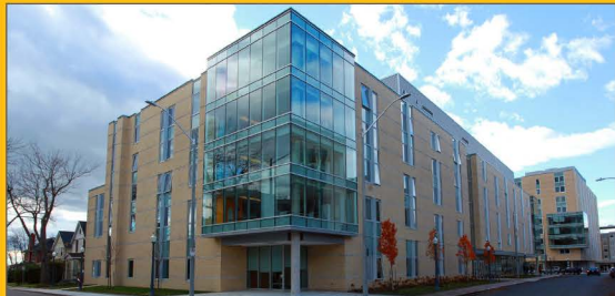
David C Smith House